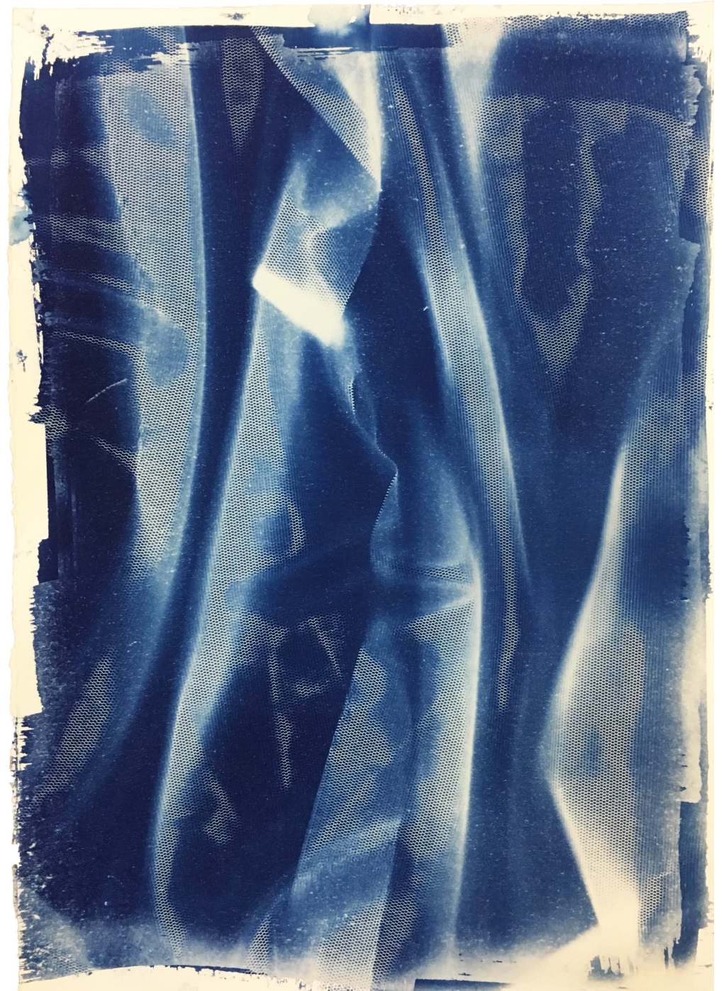
SITAARA STODEL blue 1, 2019 cyanotype on fabriano rosapina 350 x 250 mm R 5 570 (framed)